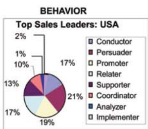
Study 1: Top Sales Leaders, USA N=178

Contact your TTI distributor for more information.