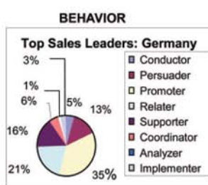
Study 2: Top Sales Leaders, Germany N=492